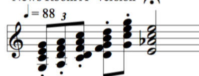
"News Room A" version