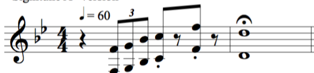
"Signitune A" version