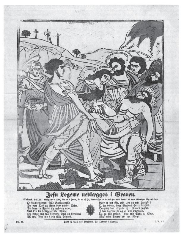
Figure 7. Laterally reversed copy of a German lithograph probably printed in Nürnberg ca. 1830. The original source is Raphael, The Entombment , woodcut, 1507. Printed in Denmark by Th. Petersen, ca. 1847. V. E. Clausen, Copenhagen.

The lack of shadowing contributes to flattening everything in this picture. There is no rounding—that is, no synesthetic dimension—to grasp and no space to enter. But also the relationship between image and imaged is uncertain and left to us to determine.