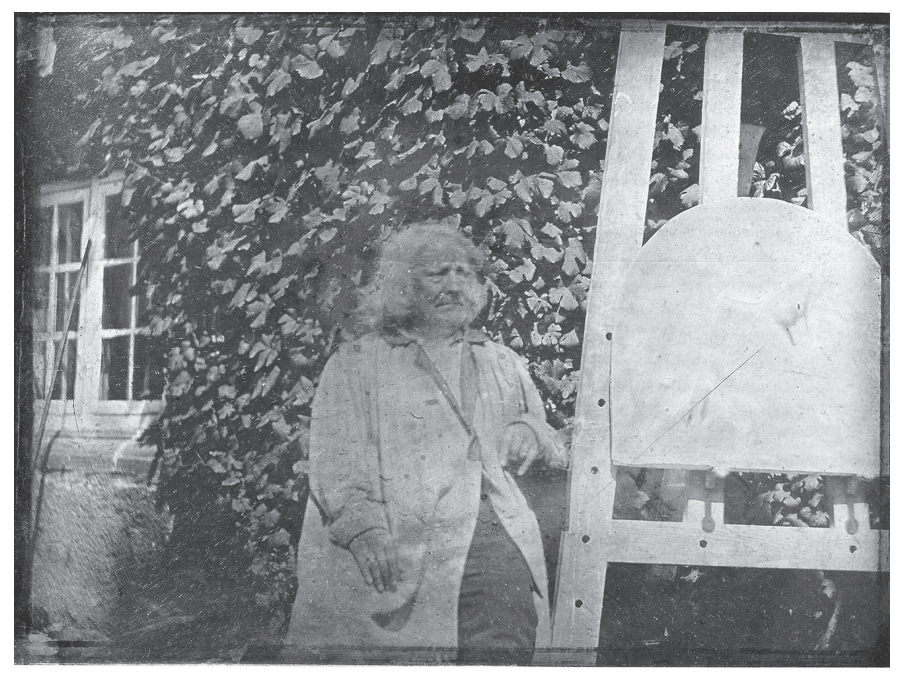
Figure 3. A. C. T. Neubourg, Portrait of Bertel Thorvaldsen . Whole-plate daguerreotype, 1844. Thorvaldsens Museum, Copenhagen.

body consisted of several transparent layers that were successively drawn off by the camera with each new exposure. Finally, there was a risk of becoming as transparent as a ghost and, like a ghost, being left without a soul.