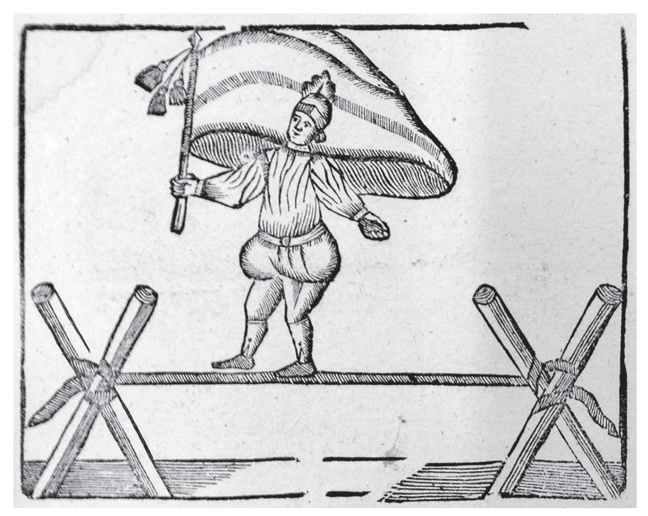
Figure 1. Tightrope dancing with balancing prop from Trondheim, 1751. Detail from a poster by De kinesiske kunstnere (The Chinese artists), 1751. State Archives of Trondheim: Poster/plakat, Statsarkivet, Magistraten B, bd 3, Offentlige skuespill & forestillinger.

Established European theaters would seldom hire an artist who was not within their closed circuit, and consequently, many ensembles had to move regularly in order to find work. Some probably preferred this, but others likely went in search of a safer or more stable work environment.