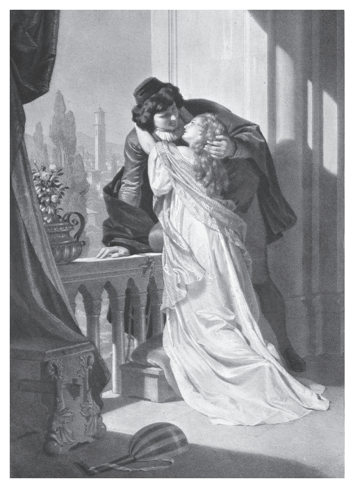
Figure 2. Romeo and Juliet's Farewell Kiss , lithograph by Ferdinand Piloty, from William Shakespeare, Romeo und Julia , trans. [to German] August Wilhelm von Schlegel (Berlin: G. Grote, 1875), facing p. 75.

(SKS 6:156 / SLW 167), namely Juliet sunk in admiration at her lover's feet. Her gaze at Romeo is filled with heavenly bliss, "but Romeo stops this look and with a kiss all the longing of erotic love is set at rest forever, for the reflection of eternity surrounds the moment with a halo, and no more than Romeo and Juliet does anyone who looks at the picture think that there will be a next moment, even if it were only to repeat the sacred seal of the kiss" (SKS 6:157 / SLW 168). The picture of Romeo and Juliet is thus "an eternal picture" as its tableau depicts an eternal moment that can never change. Yet it is also an eternal picture because it is timeless and depicts a universal ideal that transcends history: "Do not ask the lovers, for they do not hear your voice, but out in the world ask in what century this happened, in what country, at what time of the day, at what hour it was—no one replies, for it is an eternal picture" (SKS 6:157 / SLW 168). This pair of lovers is "an eternal subject for art" (SKS 6:157 / SLW 168).