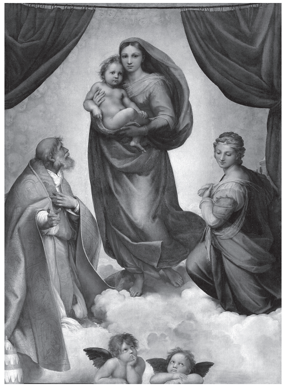
Figure 9. Raphael, The Sistine Madonna , oil on canvas, 270 × 201 cm., 1513–14, Gemäldegalerie, Dresden.

etchings in conjunction with a critique of Friedrich Ast's book Platon's Leben und Schriften (1816, Plato's Life and Writings ), in which Ast argues that Socrates's defense is written neither by Plato nor by Socrates himself, but by someone unknown. Kierkegaard finds Ast's viewpoint absurd and—(Romantically) ironic.