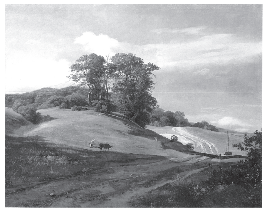
Figure 6. J. Th. Lundbye, Søbyvang. Oil on canvas, 1841. Ordrupgaard.

The Visual Culture's Popular Images: Performativity and Temporality