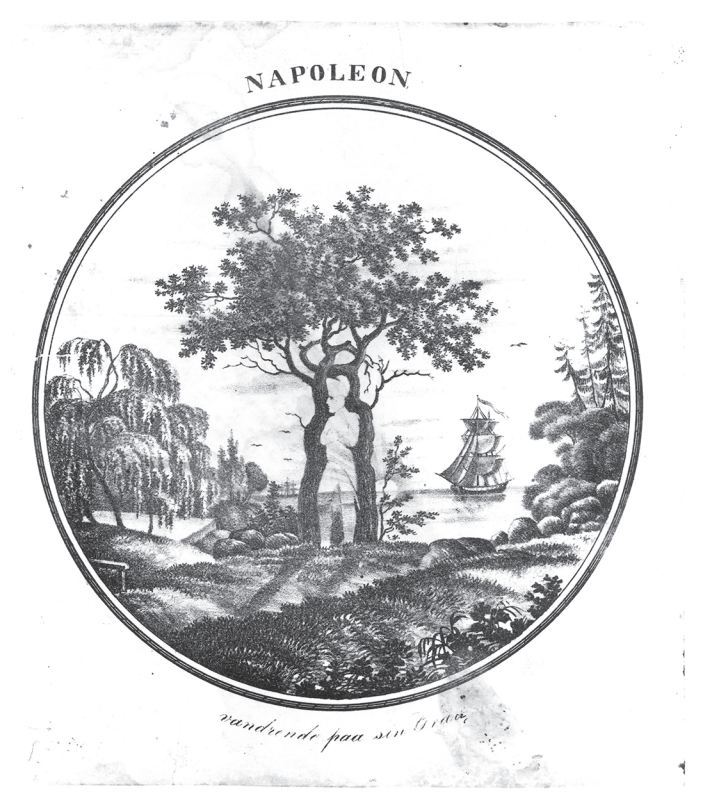
Figure 8. Anonymous, Napoleon Haunting His Grave , engraving, ca. 1820. Royal Library, Copenhagen.

The trick picture gives us an understanding not only of Kierkegaard's perception of Socratic irony, which reappears, reworked, in his diagnosis of controlled irony, but also of the manifestation of the relation between the dialogue partners that the controlled irony takes as its premise: co-acting, co-creating, producing, and, in brief, performing. If we transplant the traits and abilities of the trick picture, and the perception of the reception process that determines its design, there appears to be a relation between Kierkegaard's opting for the popular pictorial culture and the controlled irony.