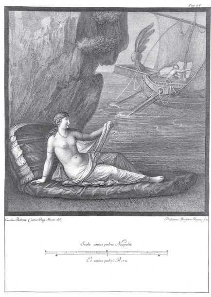
Figures 4 and 5. Theseus and Ariadne. Engravings. Illustrations from Le Pitture Antiche D'Ercolano e contorni encisi con qualche spiegazione, vol. 2 (Naples: n.p., 1760), 91, 97 (plates 14, 15).

an arrow flies from each bow, they accurately hit the mark; we see and we understand that both have hit one spot in his heart to symbolize that his love was the nemesis that avenged. (SKS 2:391–92 / EO 1:404)