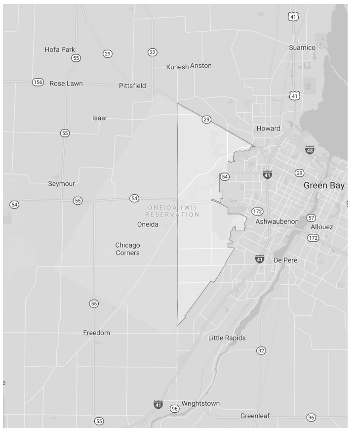
FIGURE 2. The boundaries of the village of Hobart.