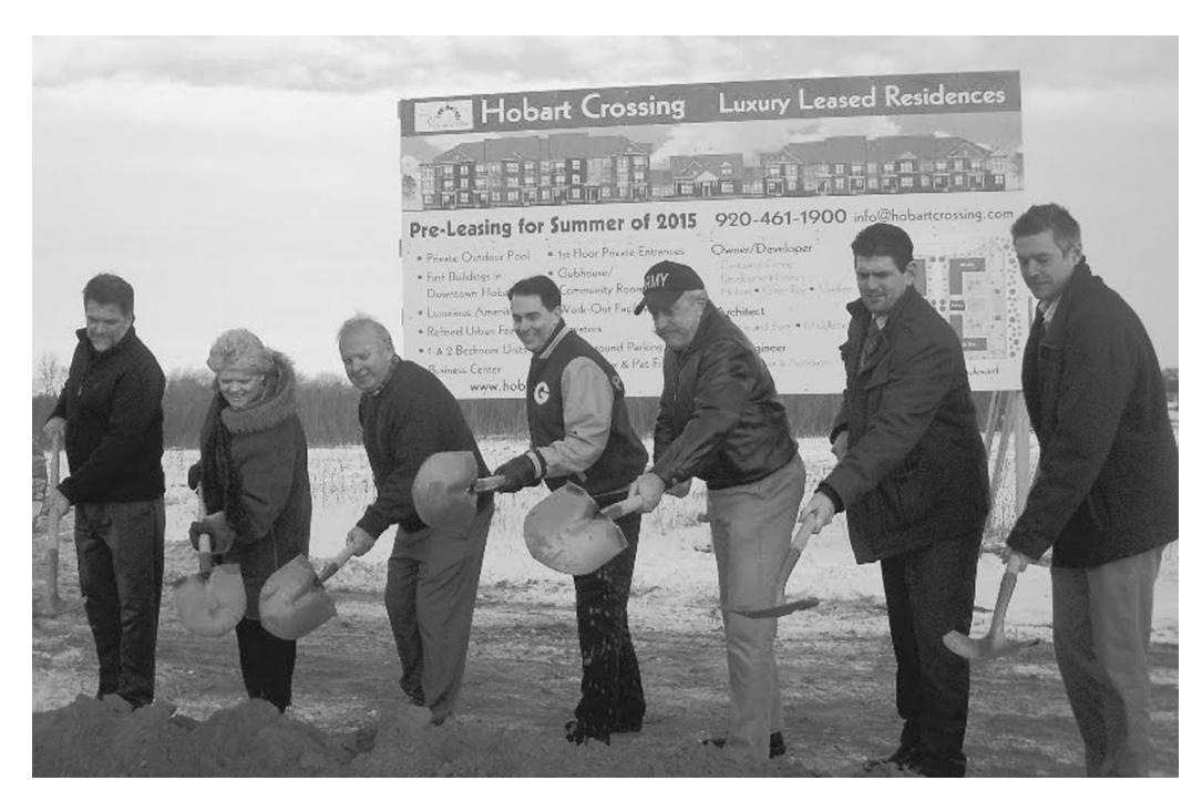
FIGURE 3. Wisconsin governor and Republican presidential candidate Scott Walker (center) participating in a groundbreaking ceremony for a new development in the village of Hobart. 2015.

The Village of Hobart is now one of the fastest-growing municipalities in Wisconsin and has recently been successful in both development and litigation. A decade ago, Centennial Centre was nothing but empty fields, the Press Times reported. The new development has since exceeded expectations, having led to the construction of nearly $130 million in taxable property, bringing total property values in Hobart to $975 million. Moreover, the population of the village of Hobart has jumped 53.5 percent (from 6,182 to 9,496) since 2010, according to the U.S. Census Bureau's 2018 estimates. The village also recently claimed an important victory against the Oneida Nation, with the U.S. District Court for the Eastern District of Wisconsin having ruled the reservation boundaries formally "diminished" by allotment. That is, the Oneida Nation cannot broadly assert its jurisdiction over all lands within the reservation but only those lands that are currently held in federal trust. The nation has appealed and remains undeterred in its effort to reacquire 75 percent of the land within the reservation by 2033.